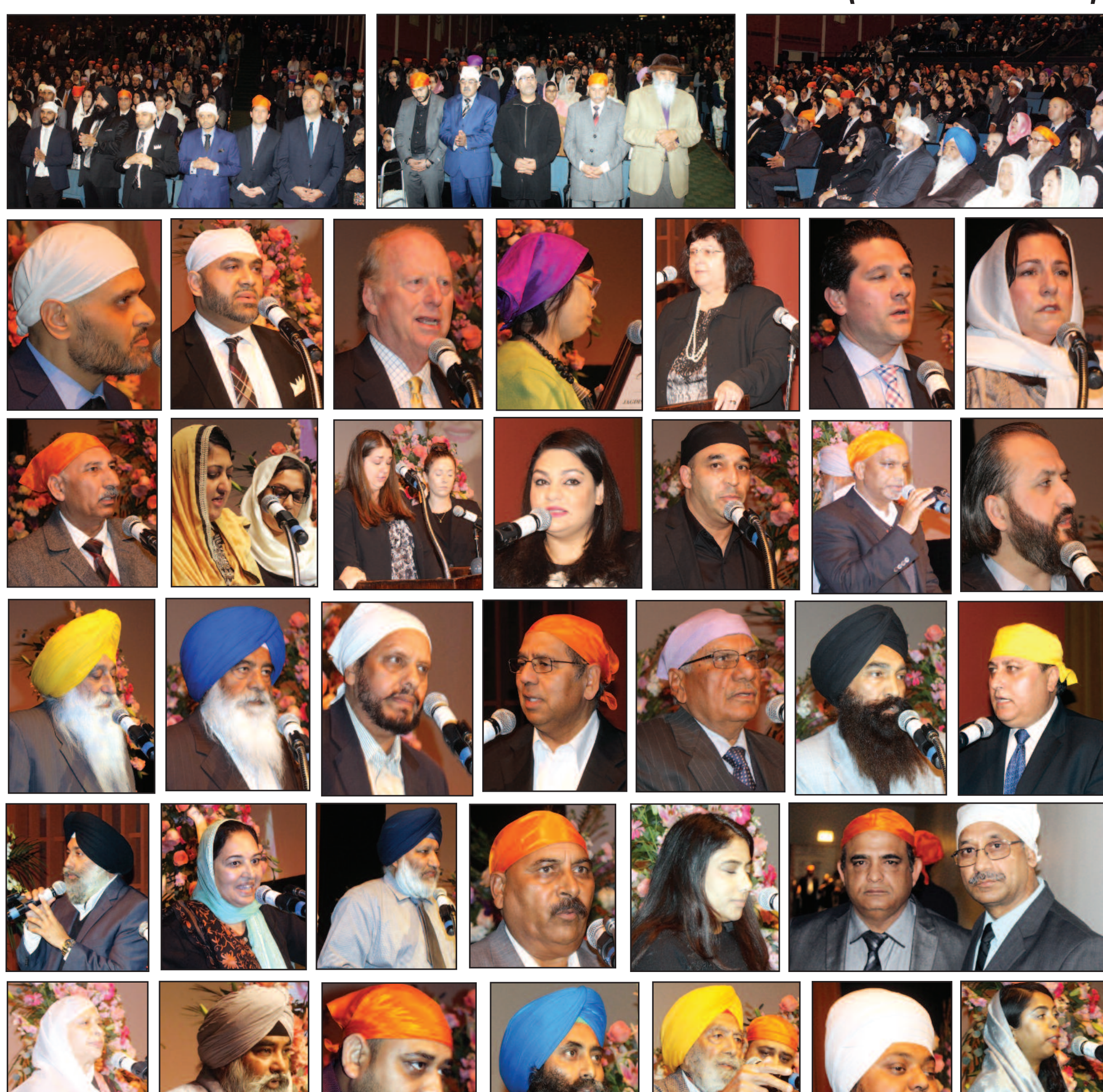
(Continued from page number 1)